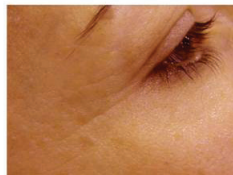
After One Clinical Treatment